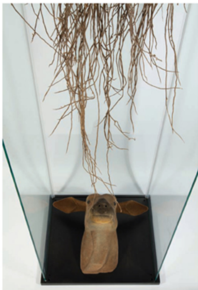
2/ City of Dreams: 7 (detail), 2012, bamboo, object, plant fibre, glass cabinet, 222 x 55 x 40cm.

'Let there be questions', says Dyer, of her installation, and of a process centred more wholly on the peripheral; 'to see the peripheral before the centre' is an integral part of her visual mantra. This may be seen in the way the installation has changed between my visits; the way the buildings on the work's central (draftsman's-like) table have been shaped and transformed with the addition of new materials such as plastic wrapped in layers with white string, giving them a ghostly appearance, like remnants from a post-nuclear mausoleum. Some of the buildings now also have more organic accents in the tufts of coconut husk which sprout from under edges and through apertures. The colour and texture of the husk, reminiscent in parts of pubic tangle, evoke a sensuous decay, the inside (internal matter) oozing and spilling beyond the architectural skin.