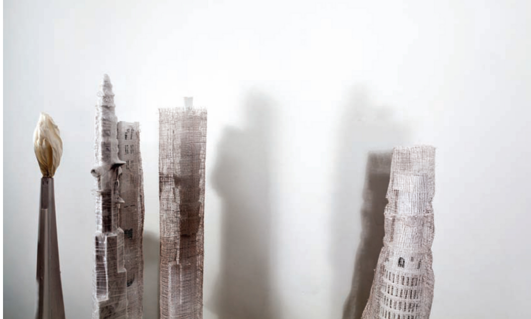
1/ Jayne Dyer, City of Dreams , 2012; installation view (detail) of work in progress; image courtesy the artist and China Art Projects, Beijing/Hong Kong; photo by Jayne Dyer