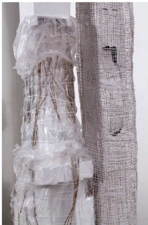
2/ City of Dreams (detail), 2012, card, plaster, thread, plastic, dimensions variable