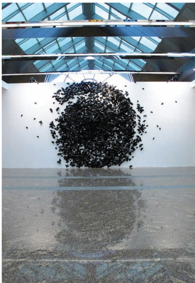
2/ The Butterfly Effect: Istanbul, 2012, 10,000 black butterflies, die-cut, laminated, dimensions variable; shown as a site-specific installation at the Haliç Congress Centre for ARTBosphorous Contemporary Art Fair, Istanbul, Turkey, 15 to 18 March 2012. Dyer has also exhibited versions of The Butterfly Effect series in Hong Kong, Melbourne, Taipei, Hangzhou and Macau

City of Dreams is a portentous work. In concept and materiality, Dyer's installation evokes the work of fellow Australian installation artists Mikala Dwyer and Janet Laurence who are similarly tuned into the ecological dilemmas of our age. In subject City of Dreams partly recalls the 'utopian city of the future' of US artist Mike Kelley's major work, Kandor Con (2000), shown as part of the 7 th Shanghai Biennale, 'Translocation', in 2008. Both Kelly and Dyer unveil a more dystopian picture overall but Dyer's 'city' at least still allows space for dreaming, regeneration and reflection including her crystal ball, atop a lower-story plinth and echoing the base of the nearby tower that supports the installation's veiled crusader. It's not Dyer's personal crystal ball but one gathered in her mercurial, bower-birding ways, and placed as much as a visual ploy (telescoping, upside-down, the view around it) as a crystal-deft and solid sign of the pervasive allure of glass in contemporary cities.