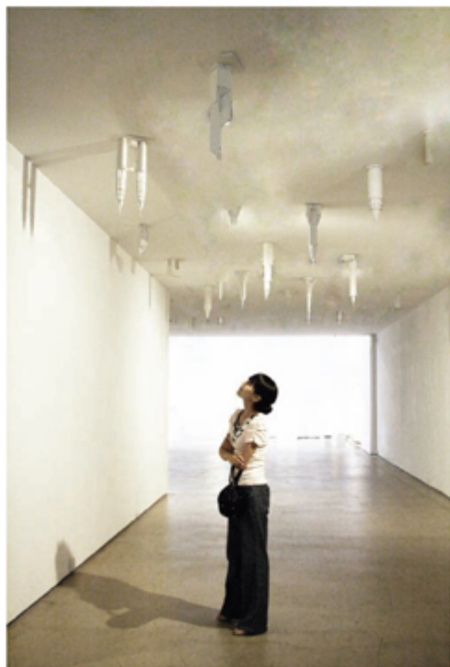
1/ Utopia , 2010, 20 contemporary and historical iconic architectural models, inverted, card, paper, 30 to 50cm height; installation view (detail), as part of postEDEN , Today Art Museum, Beijing, China