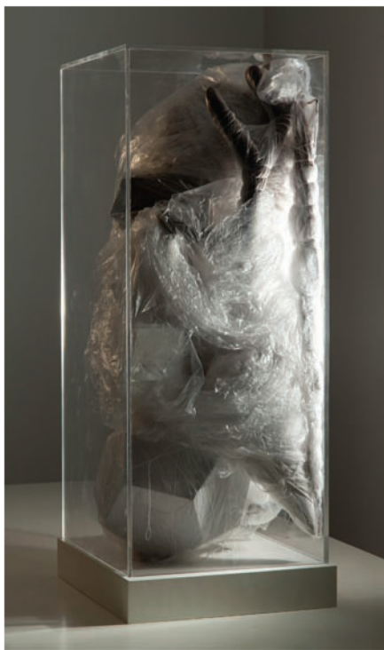
1/ City of Dreams: 8 , 2012, objects, plant fibre, plexiglass, 60 x 28 x 25cm