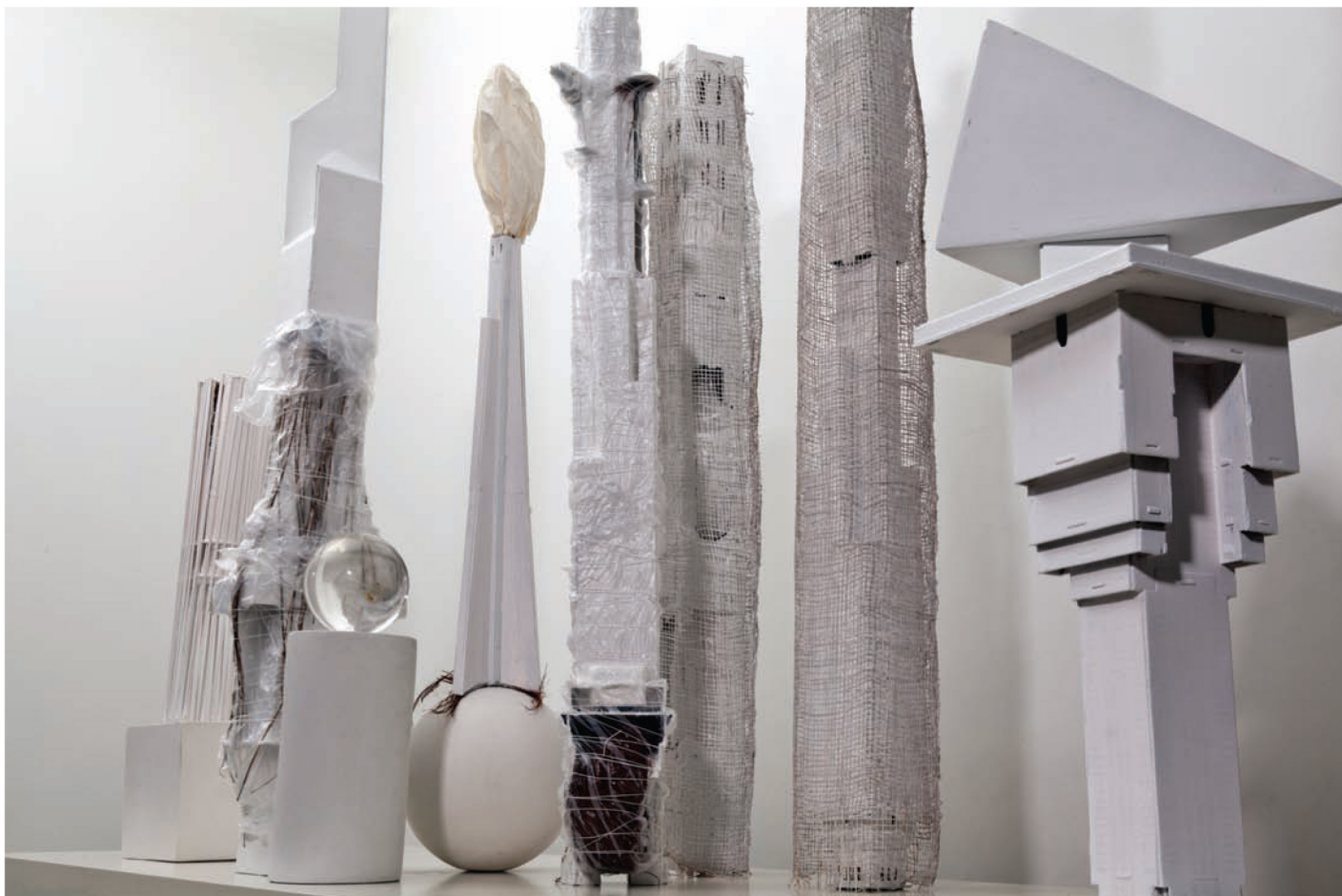
1/ Jayne Dyer, City of Dreams , 2012, card, plaster, thread, plastic, dimensions variable; installation view (detail) of work in progress